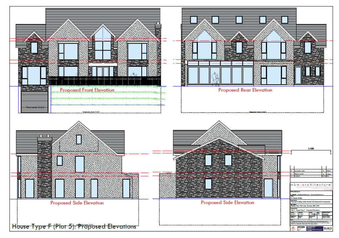
Extract from submitted elevations - Plot 5 received 7th July 2021