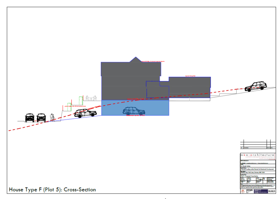
Extract from submitted cross section – Plot 5 received 7th July 2021